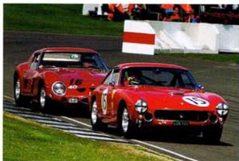
Rare and extremely valuable Ferraris are a common sight at Goodwood

racing and the sound of the glorious engines blasting around the circuit is what dreams are made of. With suitable attire and passes, you can wander around the paddocks and get up close to the vehicles. Highlights for me were a Bugatti Type 35, Maserati 250F and an ultra rare prototype Ford GT40. After a fantastic two days in sunny West Sussex and it was time to find the Hummer in the car park and head back to London. Being a good foot or so taller than most cars meant this was an easy task and soon we were relaxing inside. The Hummer really grew on us over the weekend. On congested roads a supercar can become frustrating, yet the Hummer being so underpowered for its mass meant that speeding was unlikely. It sits happily in traffic and won't be overheating like a classic Lambo. It was just a fun car to drive around. It bought out the schoolboy in us - sort of like a big Tonka toy! (AR) GOODWOOD.COM